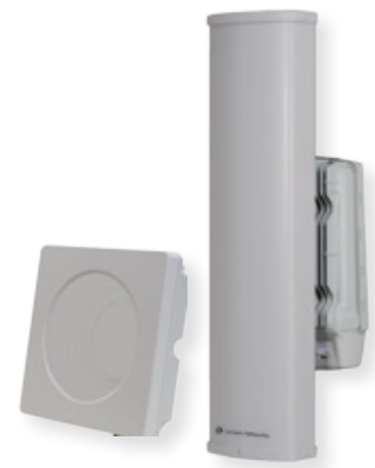
CAMBIUM PMP 320 SUBSCRIBER MODULE & ACCESS POINT

The PMP 320 complements 802.16e WiMAX networks with an outdoor fixed solution that delivers maximum performance, coverage, security and ROI.